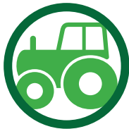
Agriculture Transportation Usage

This open house will be an informal meeting with information on display for review by the public and interested persons. No formal presentation will be conducted.