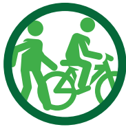
Bicycle & Pedestrian Movements

Worthington Fire Station 830 2nd Ave Worthington, MN 56187